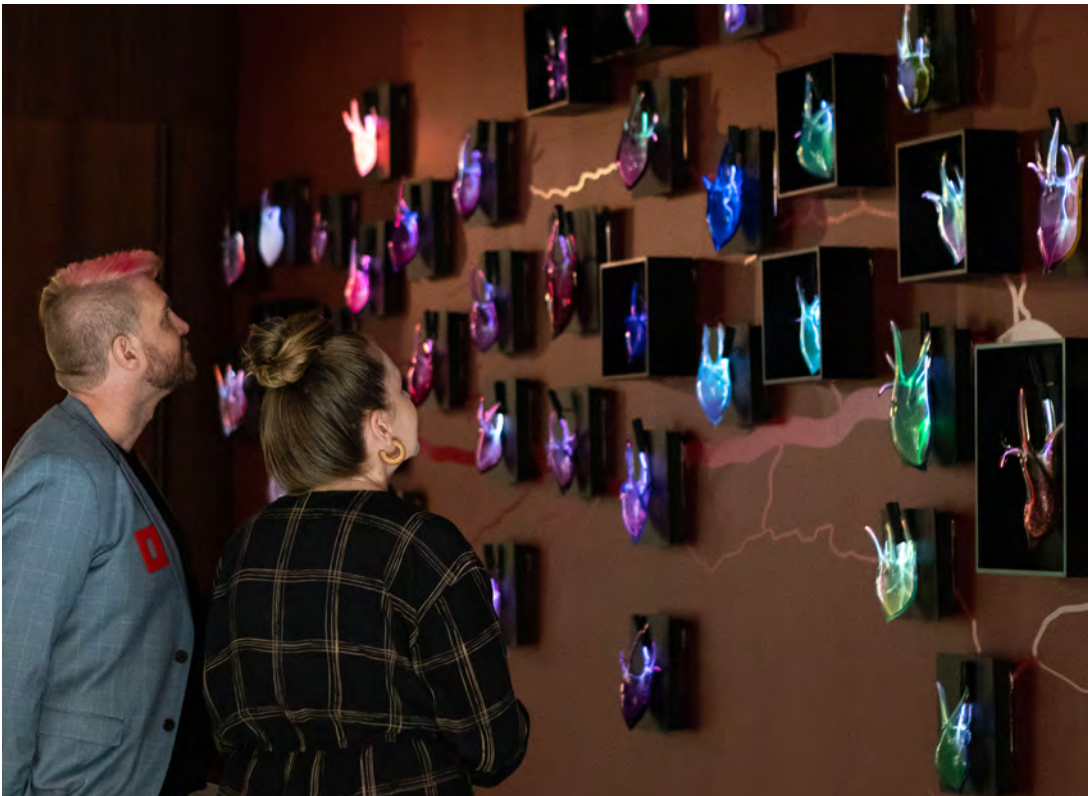
spaces between movement and stillness by Harriet Schwarzrock.