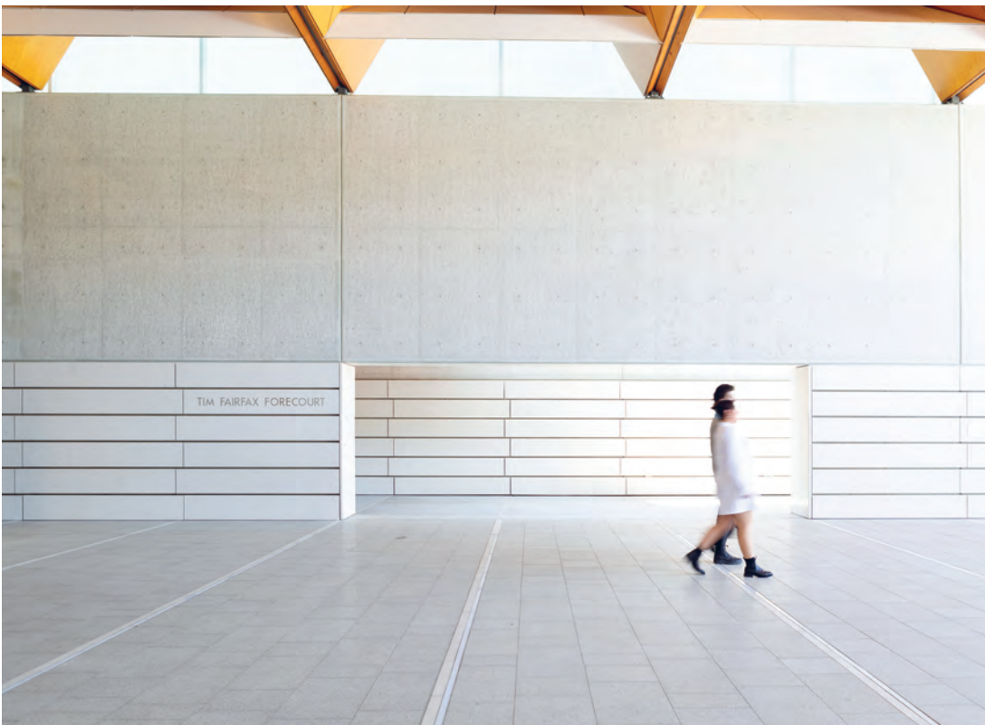
Visitors in the Tim Fairfax Forecourt.