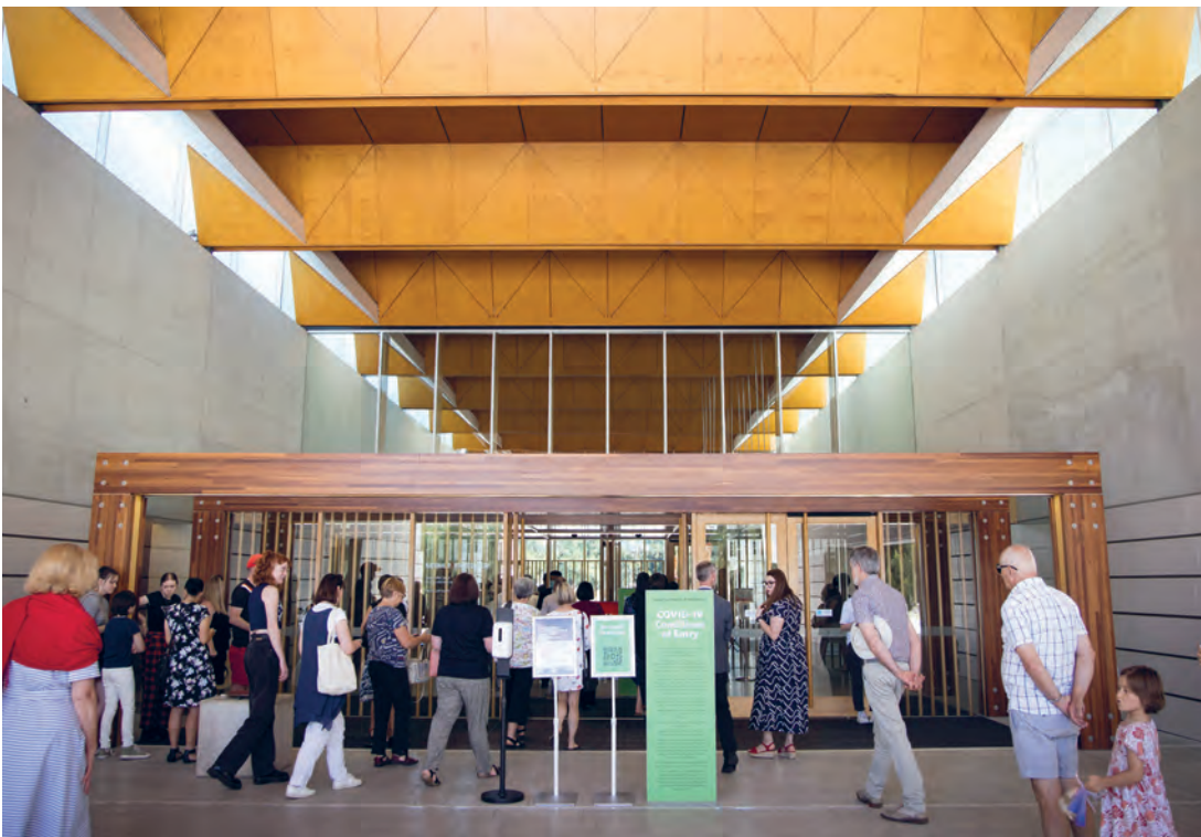
My Place dance performance by QL2 Dance in response to the collection exhibition display, This is my place.