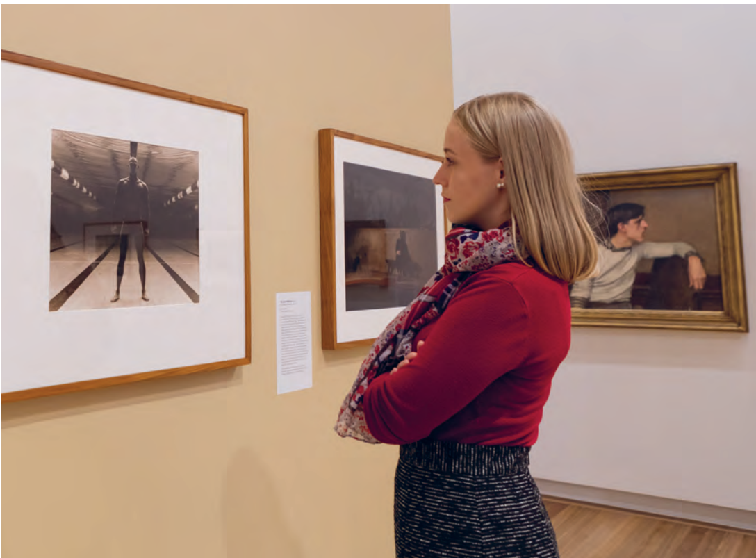
A visitor explores This is my place collection display.