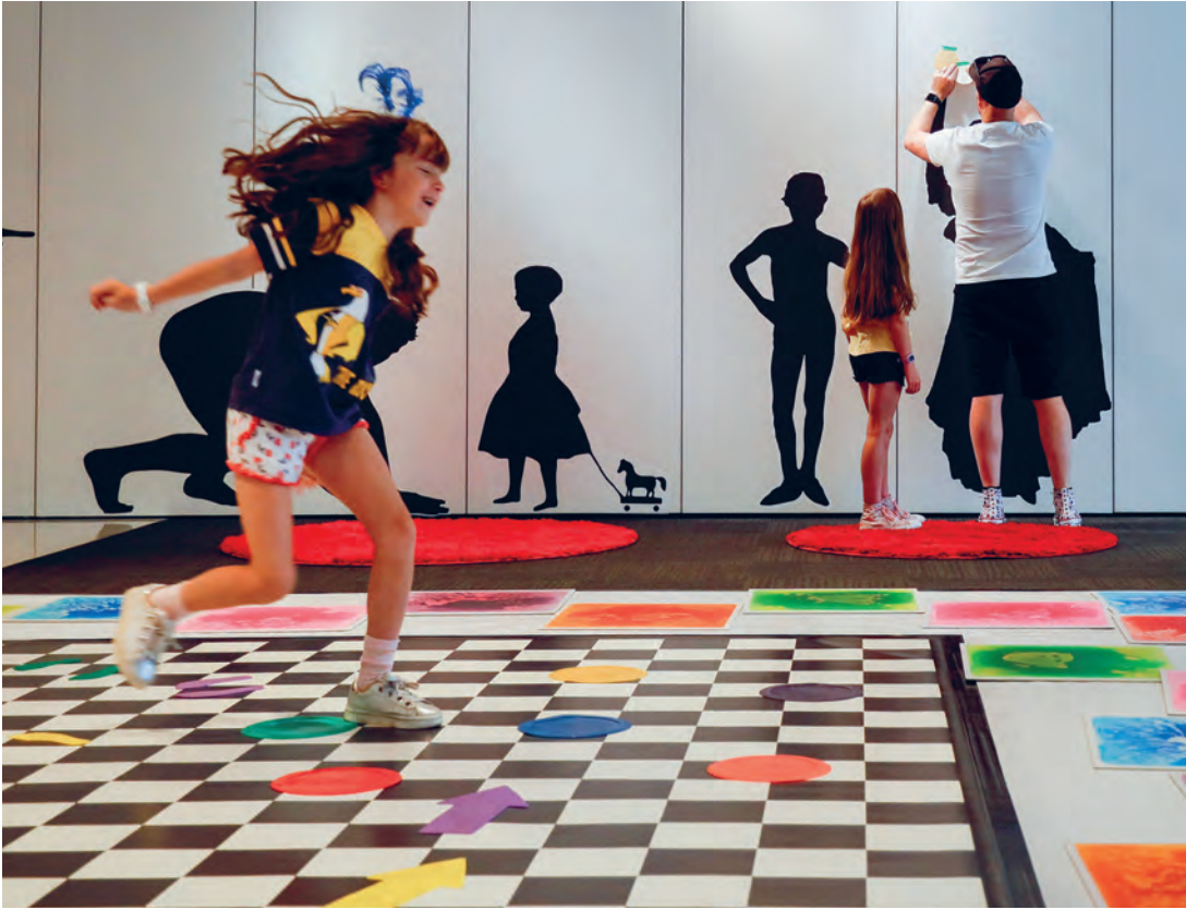
Family Space: Move it! Summer holiday space for visitors of all ages and abilities to explore pose, expression and movement.