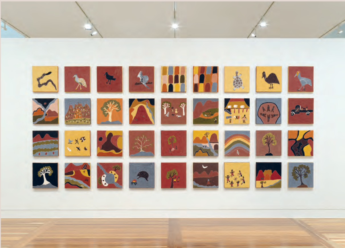
NgalimNgalimbooroo Ngagenybe 2018 Shirley Purdie natural ochre and pigments on canvas Purchased 2019 © Shirley Purdie/Copyright Agency 2021