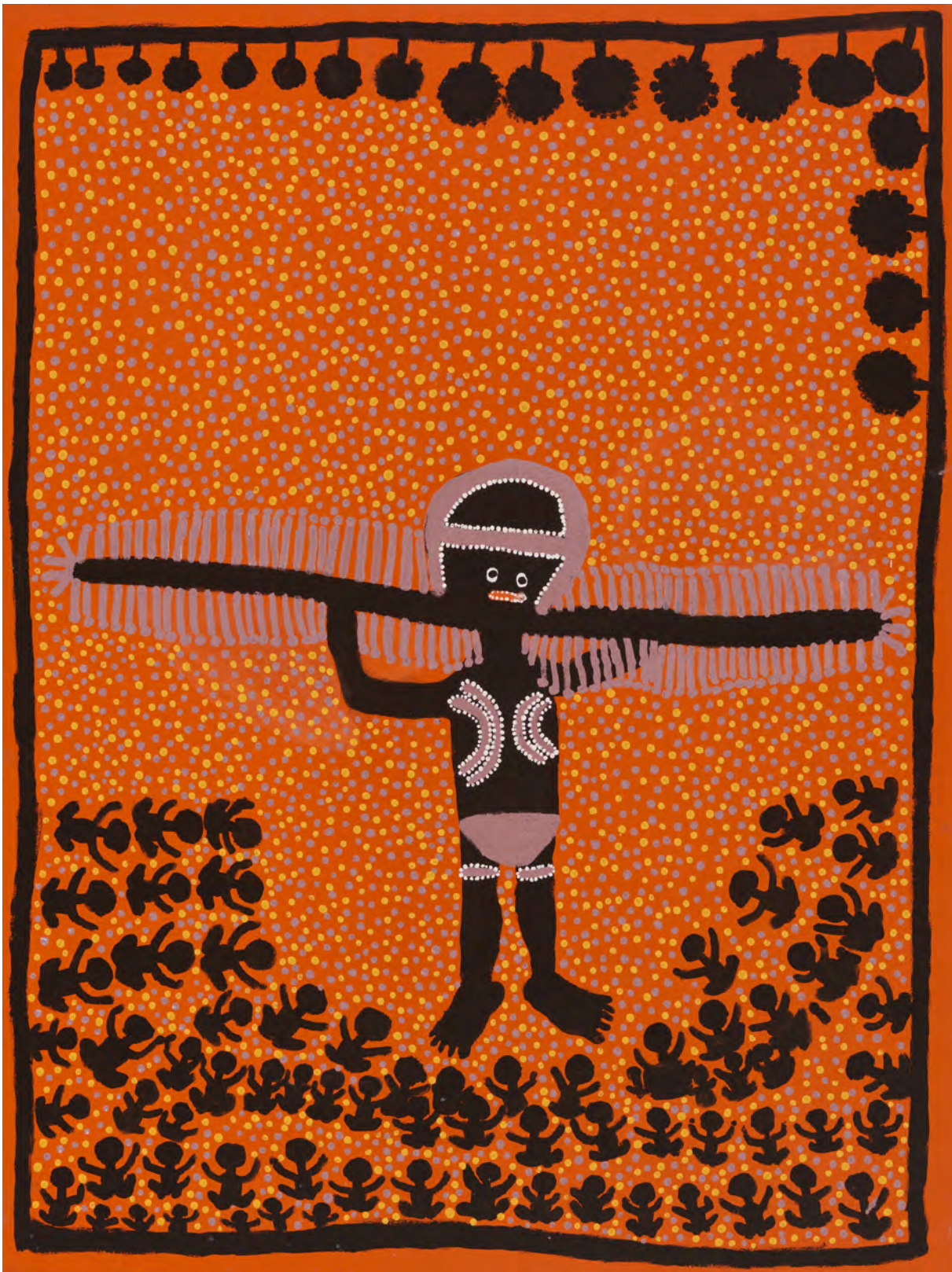
Jarinyanu dancing at Broome Festival 1990 Jarinyanu David Downs natural earth pigments and synthetic polymer paint on linen Purchased 2017