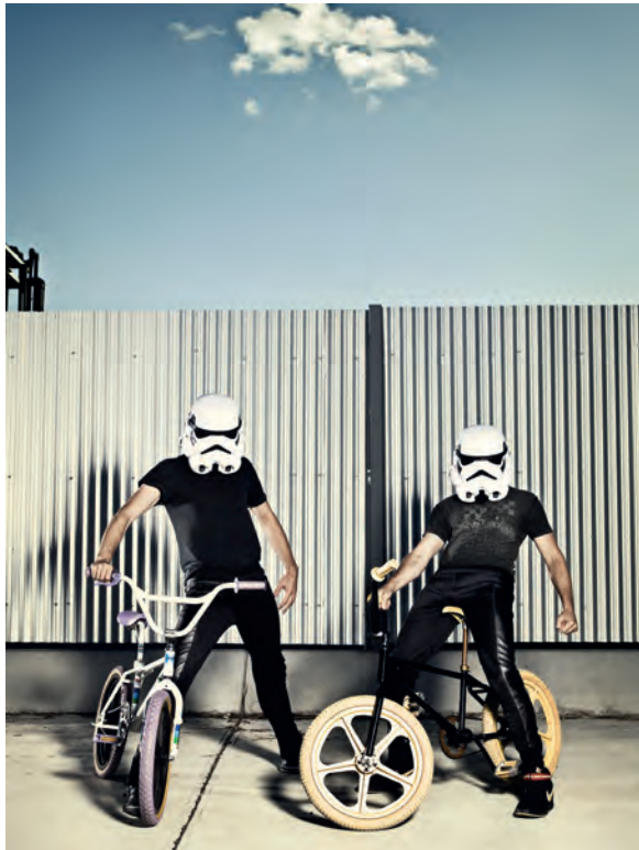
Stormtroopers 2009 Scott Newett digital print