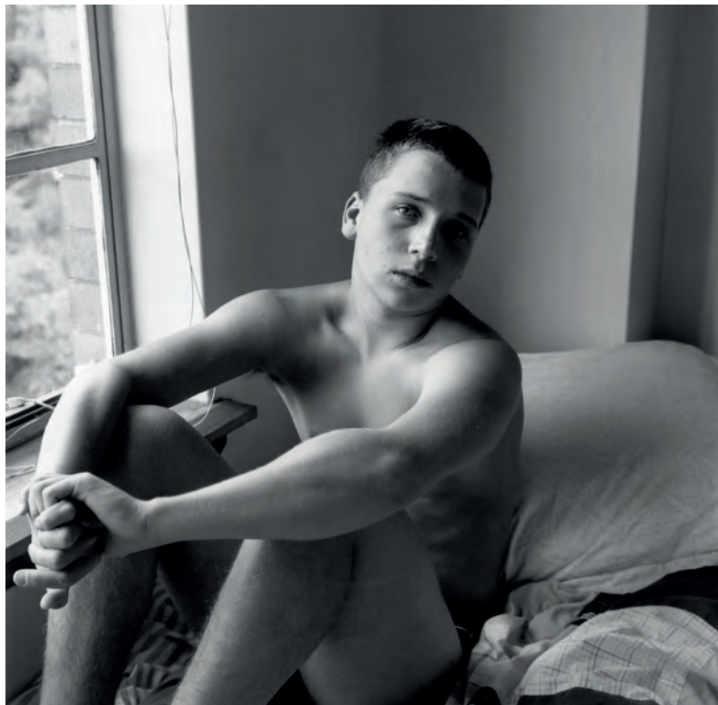
The blue of the dawn 2009 Vittoria Dussoni gelatin silver print